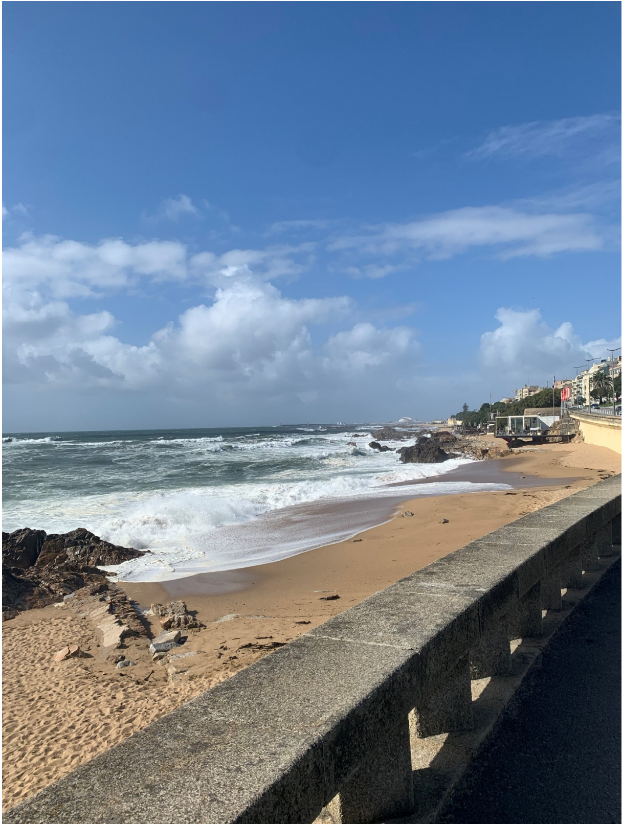
Figure 3 The walk from Porto to Matosinhos by the coast. An amazing way for an Erasmus to experience both cities