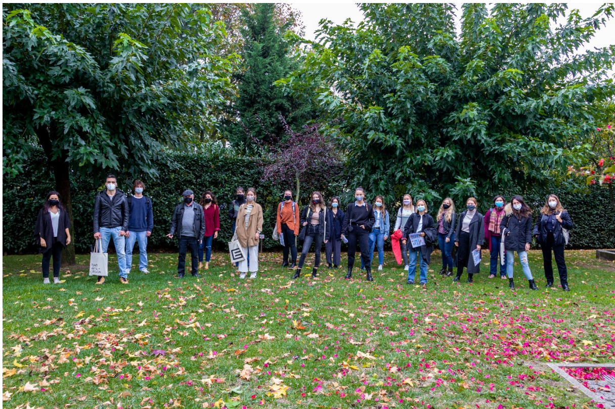
Figure 2 Photo taken of all the incoming Erasmus students (myself included)