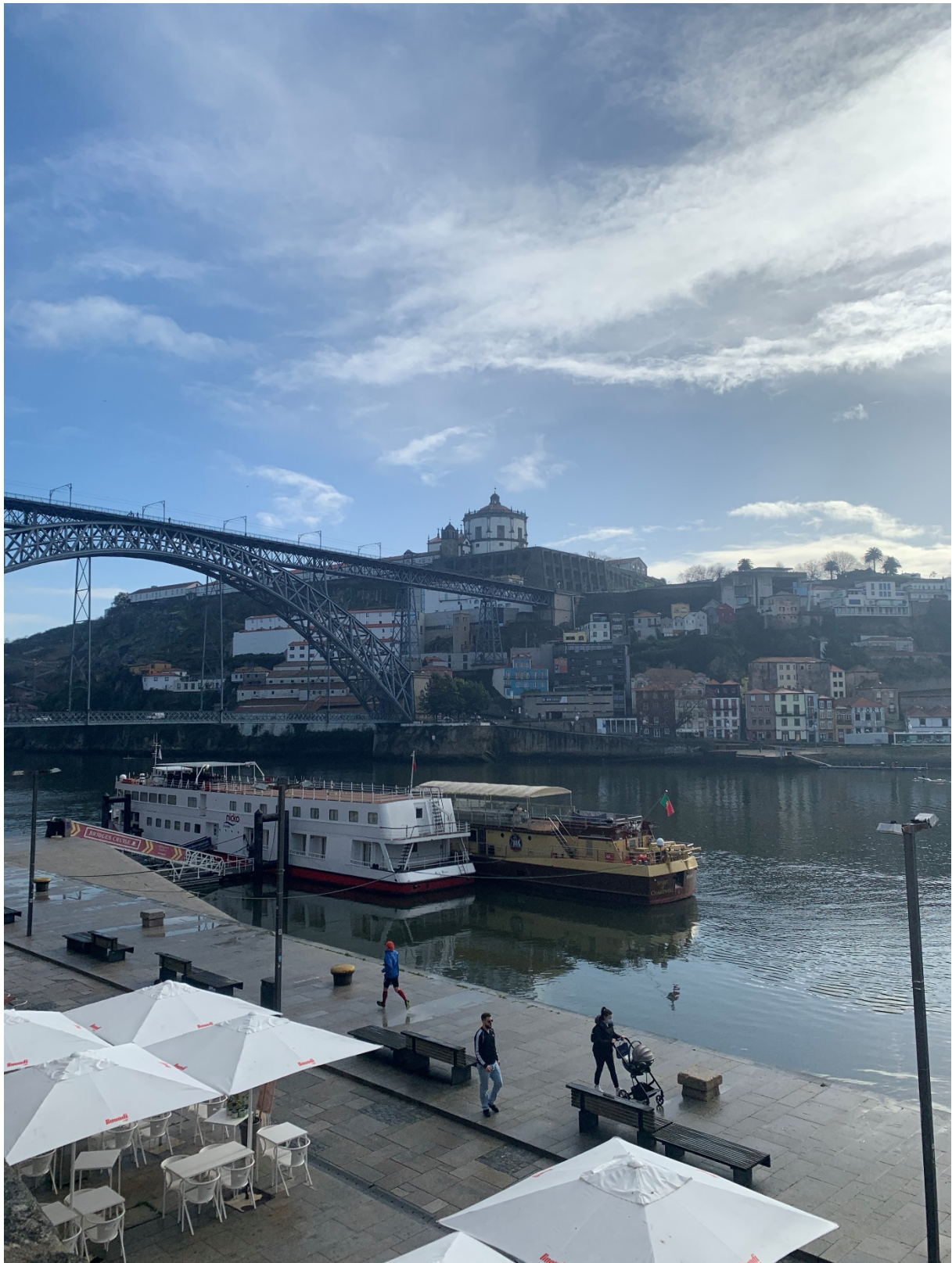
Figure 4 Porto riverside, in the centre of the historical city. You will be doing a lot of walking up and downhill if you come